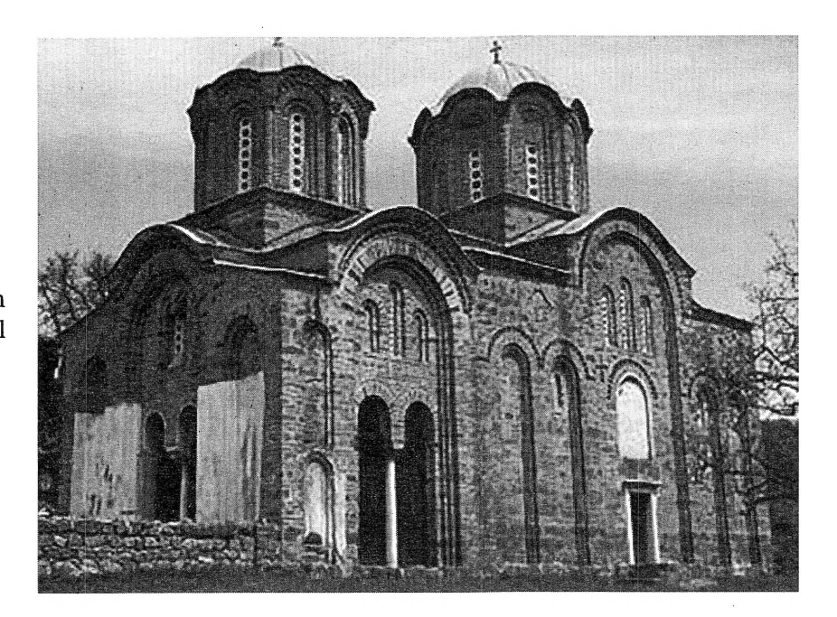
Fig. 9 The church of Saint Archangel at Lesnovo, view from the southwest Црквата Свети Архангел Михаил во Лесново, поглед од југо-запад

to Saint Archangel Michael in Lesnovo<sup>37</sup>. The elegant and graceful sacral edifice, which, according to its proportional, spatial and constructional qualities resembles a royal donation and can be easily compared to the inconspicuous visual restraint of the Marko's monastery<sup>38</sup>, reflects Jovan Oliver's social advancement in the course of the fifth decade of the 14<sup>th</sup> century by its architectural context and aesthetical merits. The remarkably conceived naos, erected in the time of the khtetor's intensive struggle for acquisition of prestigious feudal titles and marked by the refined visual articulation of the facades, has been complemented with a luxuriously designed narthex marked by the features of the lavishly executed portico facades, when his endowment was promoted to a high church administrative seat of a Bishopric<sup>39</sup>. Hence, the bicameral , two-domed and two phased edifice of Jovan Oliver in Lesnovo sublimes the highest privileges of social and ecclesiastic dignity into a unified and lavishly executed architectural organism ( Fig. 9 ).