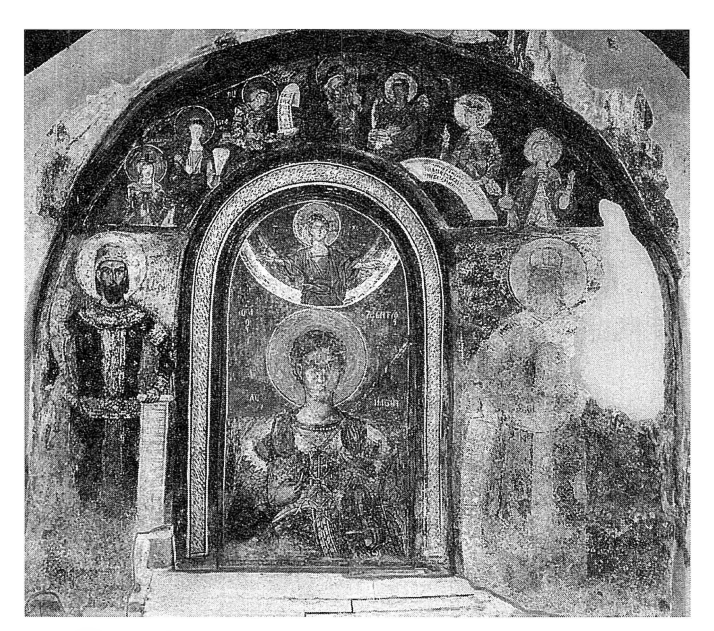
Fig. 4 The church of Saint Demetrius at Sušica, Exterior khtetorial arrangement Црквата Свети Димитрија во Сушица, Ктиторската фреска на фасадата