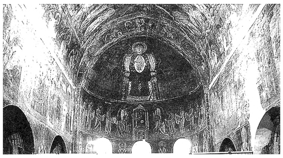
Fig. 7 The church of Saint Sophia in Ohrid, view into the altar décor Црквата Света Софија, поглед кон олтарот

clearly show that Byzantium had a much bigger problem than the Bogomils in the irreconcilable differences with Rome that would result in an unconditional divorce just a couple of decades later, the consequences of which would be much more difficult for the Byzantine party than for its former religious partner .