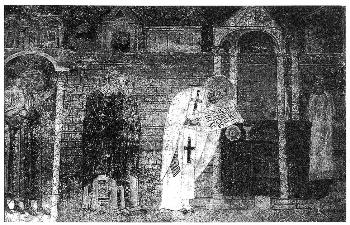
Fig. 8 The church of Saint Sophia in Ohrid, Saint Basil Officiating Црквата Света Софија, Службата на свети Василиј Велики

the illustration of the first ever represented scene with the depiction of the liturgical rite conducted by Saint Basil, than it becomes clear that by placing the ceremony within the cathedral of Saint Sophia, Archbishop Leo intended to accentuate the significance of orthodox rite for the believers' benefits of Ohrid church diocese. This symbolic interrelation of the orthodox faith, manifested by the depiction of the genuine religious ceremony and its symbolically specified performative location in the Ohrid cathedral, is the true paradigm of Leo's ideological approach towards configuration of visual didactic instruments, which show respect to the local tradition, accentuated with the ultimate religious principle of the Byzantine Metropolis. In that regard, the ambitious Constantinopolitan church dignitary whose primary role was to restore the orthodox belief in the significant and influential Episcopal see of Ohrid, can be determined as a commissioner who labeled the local tradition with the trademarks of the Byzantine Capital and classified as: