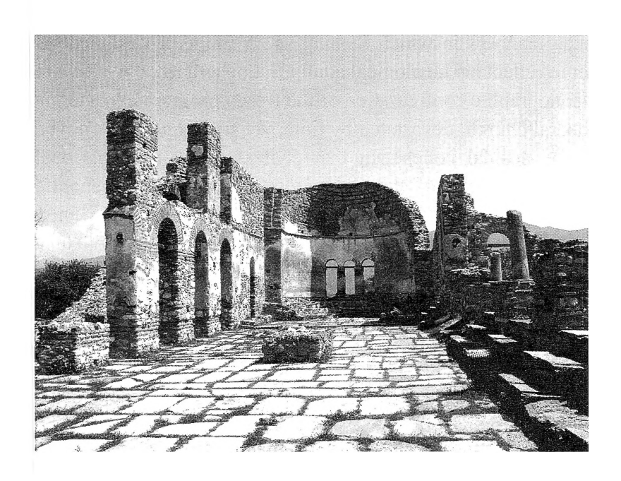
Fig. 1 The church of Saint Achilles at Prespa Црквата Свети Ахилиј во Преспа

state, but its significant historic dimensions, as well. In that context, the architectural configuration of the church of Saint Achilles at Prespa (Fig. 1), built towards the end of the 10<sup>th</sup> century, announces the novelties of the Byzantine builders from the following centuries2, while its metaphrasic altar fresco décor prefigures the complex theological and visual concept that would become an inspiration for the Byzantine painters in the centuries to come<sup>3</sup>. Namely, the appearance of the subsidiary domed chapels, located laterally of the altar and enclosed into the architectural concept of a classical basilica<sup>4</sup>, speak in favor of a well considered architectonic solution which does not differentiate significantly from the traditional matrixes; however, it does not replicate them in a manner which would mean a notorious repetition of the spatial concepts of the sacral edifices built in the past centuries. On the contrary, the basilica ground plan, selected as a symbol of the megaprojects of the most powerful ruling figures from the historic past, is articulated in a modern way, with structural elaboration of the sanctuary which acquires a pair of new building units configured in a form of enclosed architectural spaces accentuated with domes, apparently announcing the later monumental projects that will "adorn" Byzantine territory in the period from the second half of the 12th century onwards<sup>5</sup>.