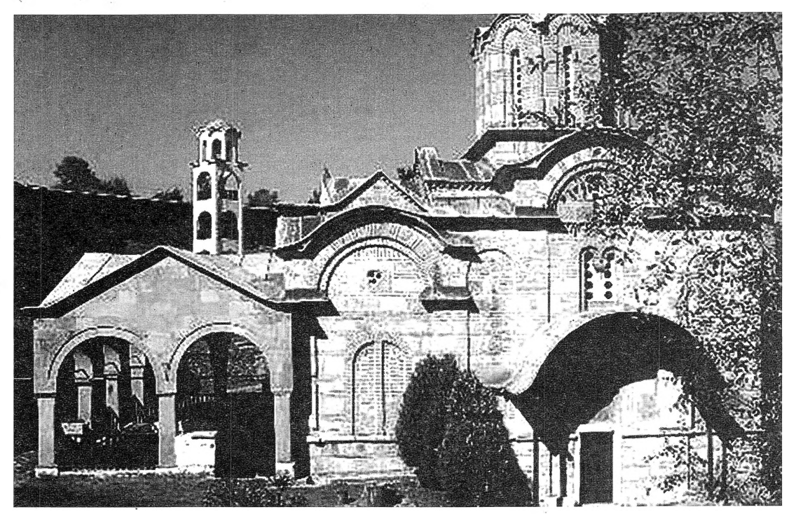
Fig. 2 The church of Saint Demetrius at Sušica, view from the south Црквата Свети Димитрија во Сушица, поглед од југ

axis<sup>13</sup>. In that regard, the monolithic columns placed under the dome are included in the building structure of the edifice not only as costly and much more luxurious supporting elements than the pillars; in a metaphoric sense, they are constructed to support the donation of the old King and its successor – as pillars of the orthodox rule in the closing decades of the existence of the Christian state and its visual culture.