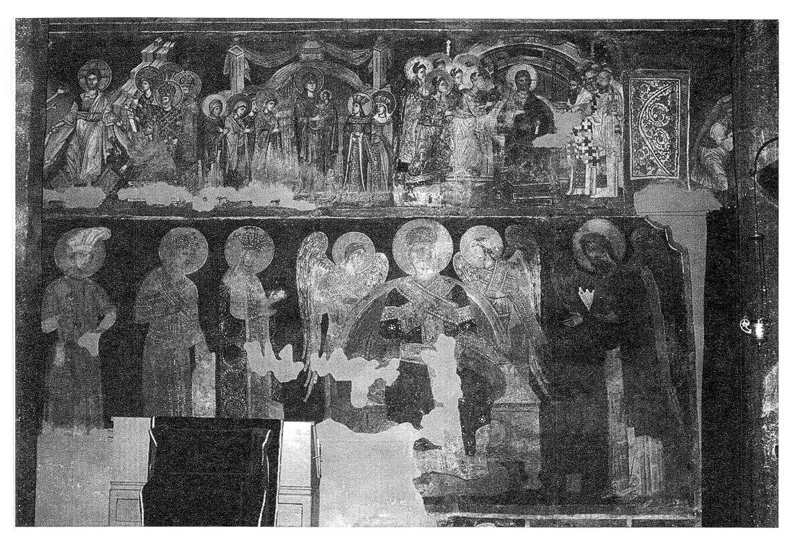
Fig. 3 The church of Saint Demetrius at Sušica, Celestial court Црквата Свети Димитрија во Сушица, Небесниот Дворец

of the characteristic features of the visual decoration of the temple is its precisely determined social dimension, accentuated through the donors' composition preserved in the interior of the church<sup>16</sup>. Although the image of King Marko seems to be almost unrecognizable due to the devastation of the frescoes, the context of the khtetorial arrangement, encompassed by the ceremonial suite of the knights of the Celestial court, is ideologically transparent<sup>17</sup>. Monumental by its dimensions, luxurious by the iconographic design and highly protocol by the manner of execution, the khtetorial ensemble occupies the entire surface of the lower zone of the church interior ( Fig. 3 ).