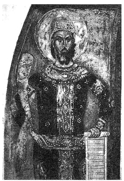
Fig. 5 The church of Saint Demetrius at Sušica, Image of King Marko Црквата Свети Димитрија во Сушица, Портретот на кралот Марко

horn with the anointment oil in the one-time Baptistery attached to the south façade of the church<sup>19</sup>), ideological (King Marko lifts the horn in search of God's protection against the Turks<sup>20</sup> or in a search of political recognition by the rivals<sup>21</sup>), ceremonial (the khtetorial arrangement marks the Royal entrance to the church<sup>22</sup>) etc. However, no one did notice that the khtetorial arrangement depicted on the façade, besides being a doppelganger to the donors' composition in the interior, lacks the fierce and passionate painterly expression of the fresco painting executed in the naos for one reason and one reason only – because it is not chronologically concurrent with the interior ensemble and originates from a later date, approximately one decade subsequently - in the time of arrival of the Metropolitan John in the Skopje area, around 1989<sup>23</sup>. Being a highly